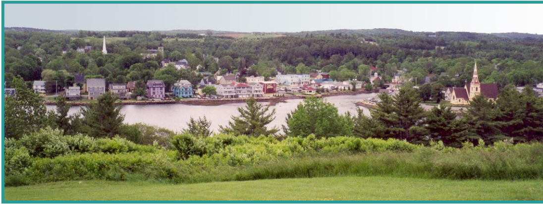
View from Cape House Deck